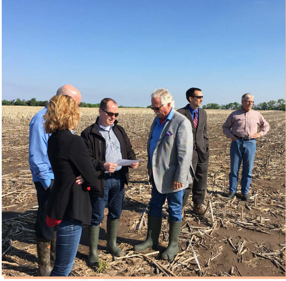
Scouting the new Hybrid Turkeys hatchery site at the Gage County Industrial Park.

Hybrid Turkeys is part of Hendrix Genetics, a leading multispecies breeding company with primary activities in turkeys, layers, pigs, aquaculture and traditional poultry. Headquartered in Boxmeer, in the Netherlands, Hendrix Genetics provides expertise and resources to producers in more than 100 countries, with operations and joint ventures in 24 countries and more than 2,400 employees worldwide.