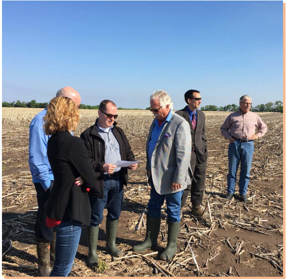
Scouting the new Hybrid Turkeys hatchery site at the Gage County Industrial Park.

Hybrid Turkeys is part of Hendrix Genetics, a leading multi-species breeding company with primary activities in turkeys, layers, pigs, aquaculture and traditional poultry. Headquartered in Boxmeer, in the Netherlands, Hendrix Genetics provides expertise and resources to producers in more than 100 countries, with operations and joint ventures in 24 countries and more than 2,400 employees worldwide.